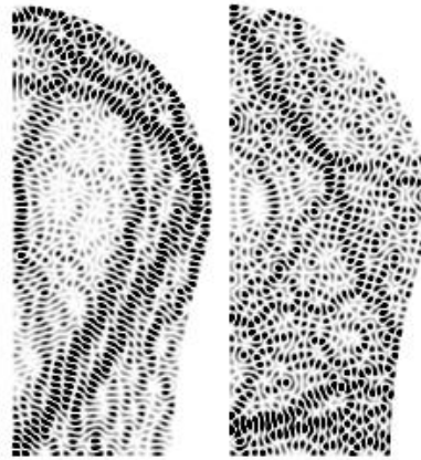
wave resonances of cavity

Waves and wave propagation are ubiquitous in nature and lead to many puzzling questions. For instance, what produces mirages in the desert? Why is it that a storm over the ocean sets off a steady swell of small-amplitude waves, but an earthquake at the sea floor can release an enormous flood wave? Can you hear the shape of a drum? In response to these questions, a great deal of mathematics has been developed to understand and predict the dynamics of light or sound waves, the propagation of quantum (matter) waves, the vibration patterns of elastic bodies, or the peculiar nature of water waves. This course will give a guided tour of mathematical wave theory together with physical applications, including normal mode theory, the linear wave equation, superposition, interference and diffraction, short-wavelength asymptotics and ray theory, dispersion, and nonlinear waves and solitons. By the last few weeks of the course, each student will have chosen a topic for more intensive study, and will work towards a final oral presentation and written report. Typically this will involve numerical investigation on a computer (in which case programming experience is helpful), but a theoretical topic is also possible.