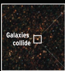
SIMULATED IMAGES OF GALAXIES

tion, rapidly converting hydrogen gas into stars. Seeing it happen helped scientists solve some questions about how large galaxies formed in the early universe. These images are based on a simulation of the merger that condenses 1.5 billion years into about a minute. The mega galaxy is about 10 times the size of our own Milky Way. News 14